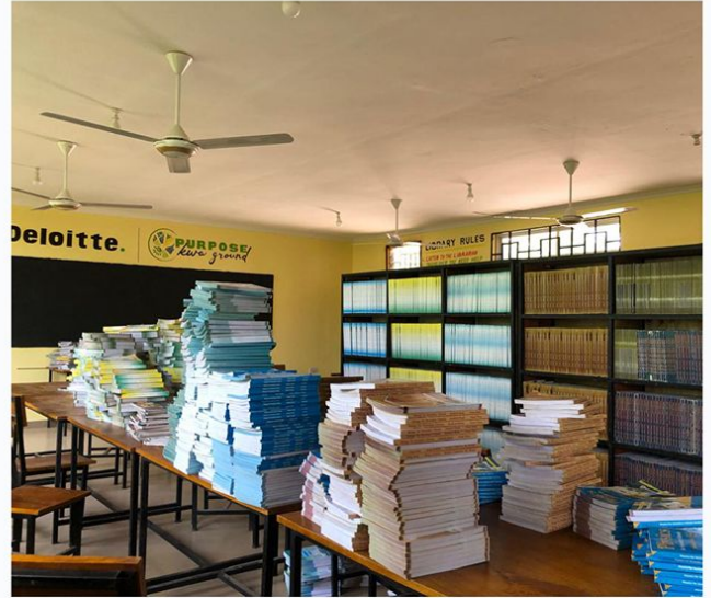
2264 books distributed across 5 schools to enhance literacy