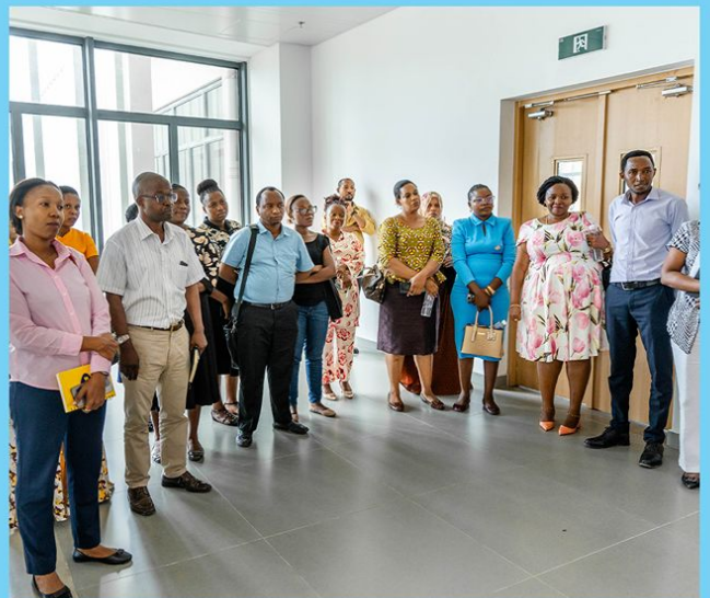
16 teachers trained at UDSM Library on cataloging, sustainability & digital access