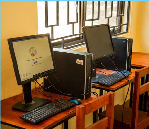
12 computers provided for digital learning through SOMA Connect