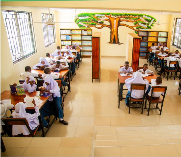
5 libraries finalized with new furniture, supporting 8762 students